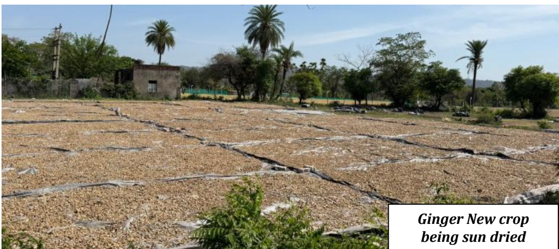
Ginger New crop being sun dried

Ginger supply from Northeast is keeping pace with demand and markets have stabilised.