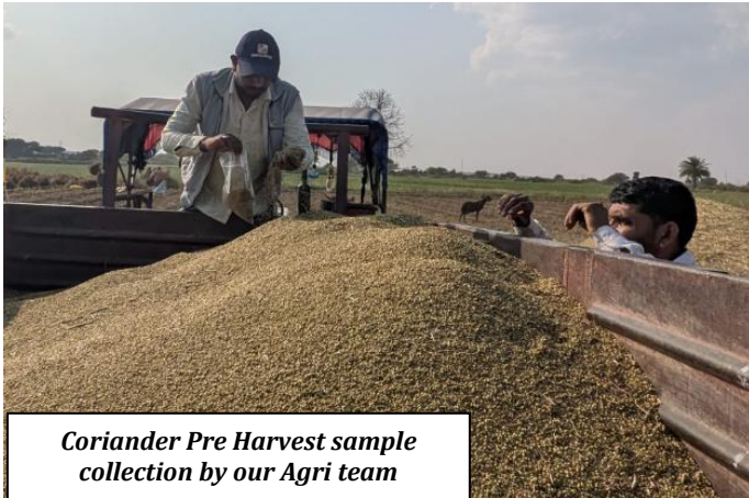
Coriander Pre Harvest sample collection by our Agri team

Markets remain firm now; supply side is lower this compared to the 2025 crop. Farmers have cut back acreage for higher remuneration crops and have added to the competing landscape “Chia Seeds” in large way, given its (financial) health benefits.