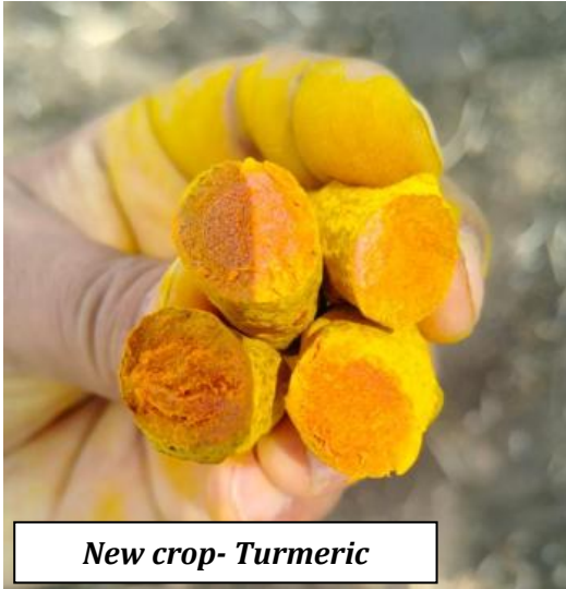
New crop- Turmeric

Crop this year is big, and it's been safely harvested. Some areas have shown a drop in yields (Minor) but overall, the crop was good. Nizamabad arrivals have come down sharply from 2,250 -2,500 MTS/ Day to now about 200-250 MTS, which also shows that bulk of their crop has been sold out. (This is normal) and happens every year.